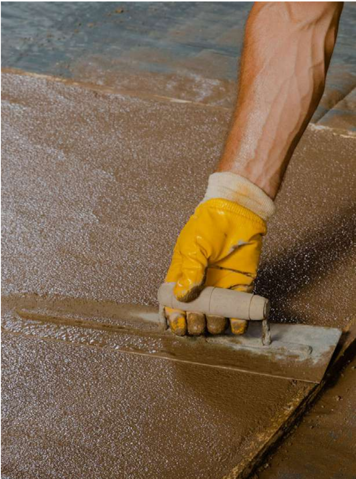
Laying the material