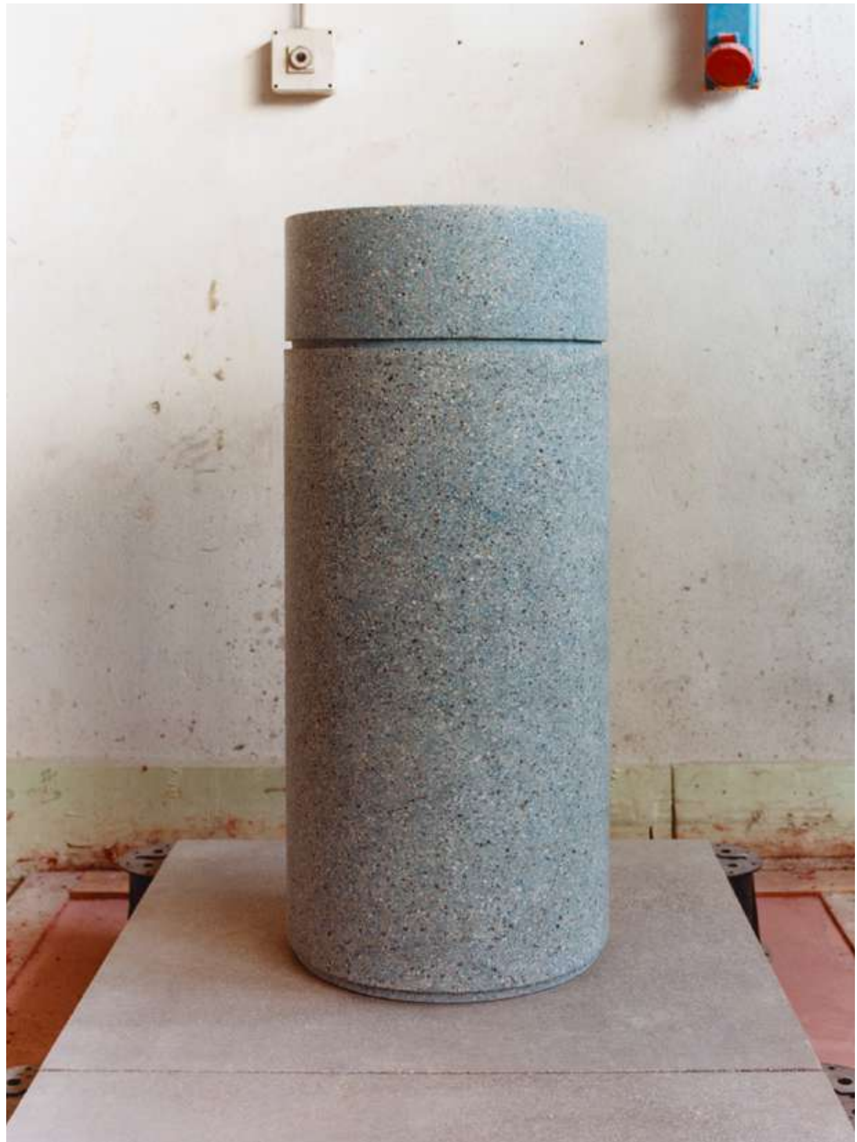
DESIGN: ENRICOMARIA TODARO

A tribute to the archetypical washbasin, is the first collection of washbasins by 70Materia. The name “Fondamenta”, meaning “foundations” in Italian, calls to mind that essential element of architecture, the basis on which every new construction rests, and evokes the centrality of water within every domestic space. The lines are squared or curved and the aesthetics essential, for a product that expresses the underlying philosophy of 70Materia.