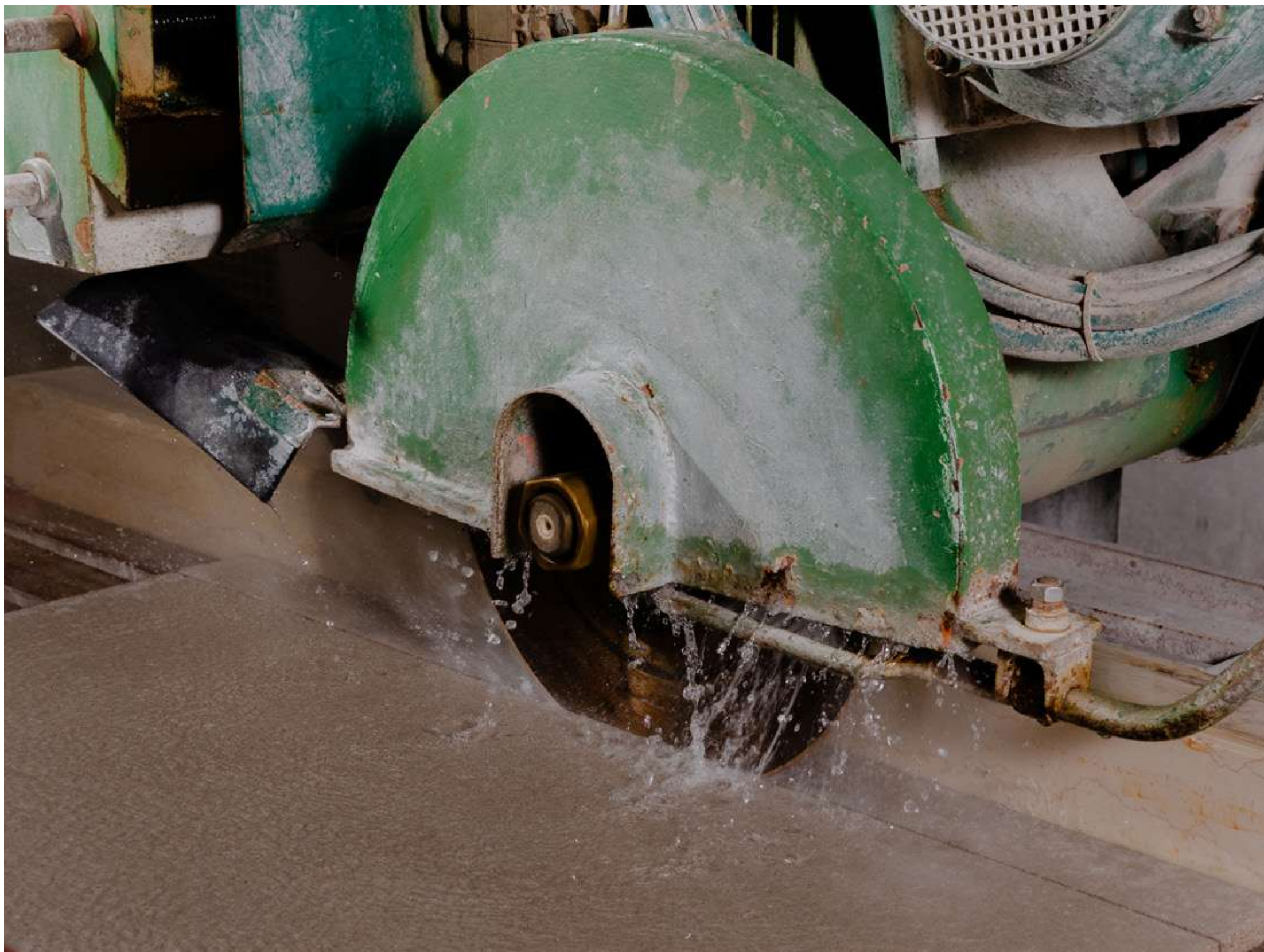
Cut to size for vertical applications and off-site components