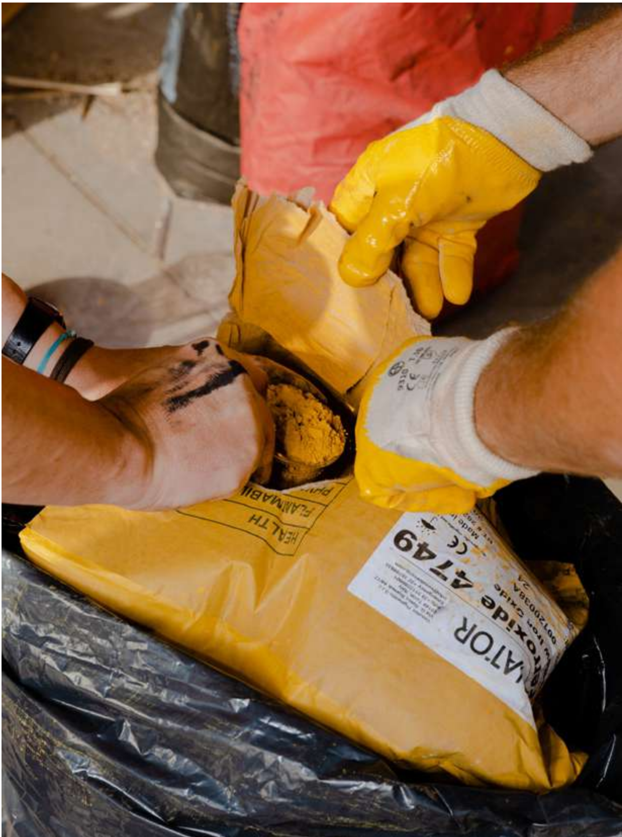
Addition of oxides