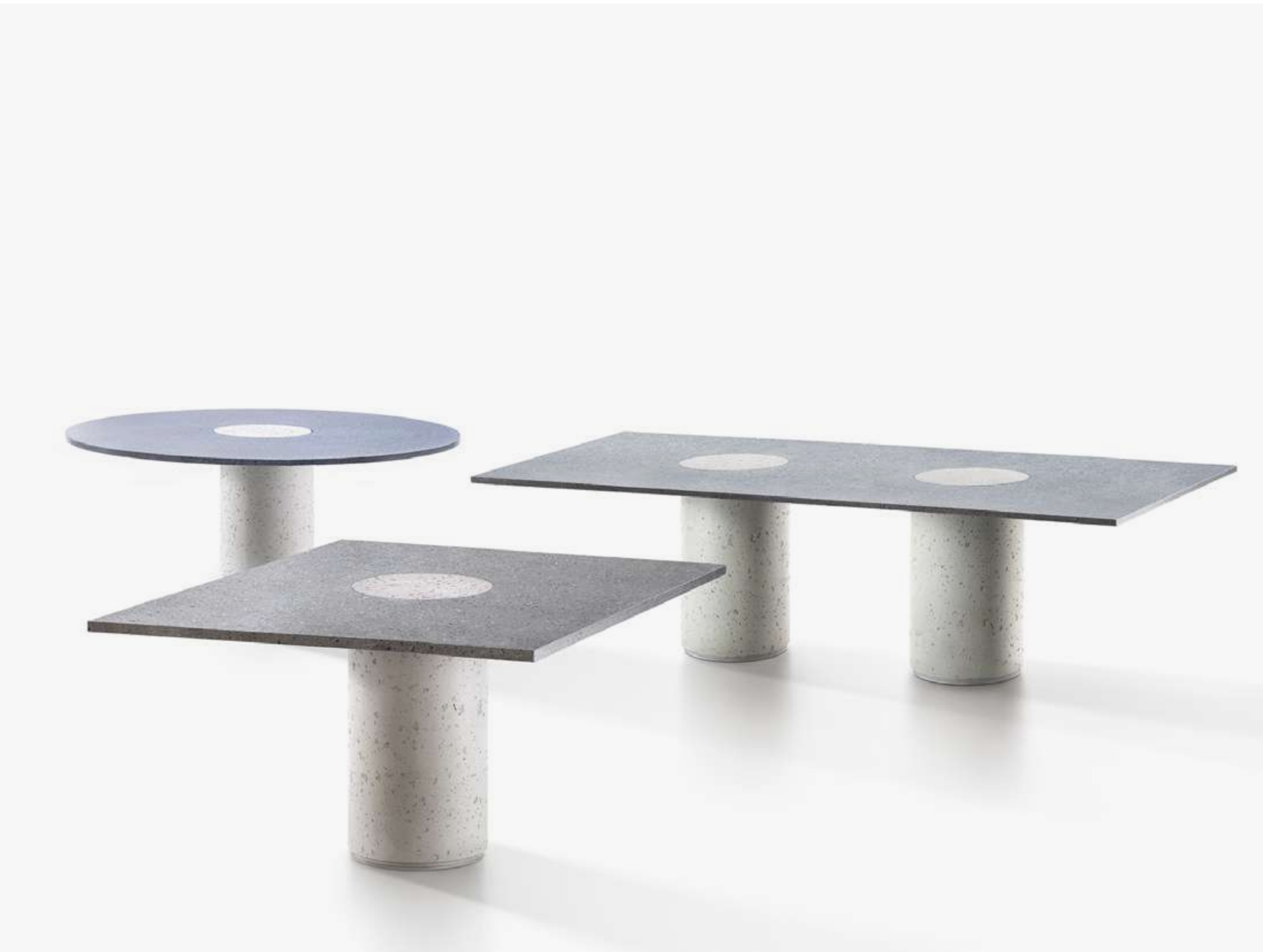
DESIGN: ENRICOMARIA TODARO

The Atollo collection of tables draws its inspiration from the emergence of material, as if silently surfacing from the ocean's depths to form a natural architecture.